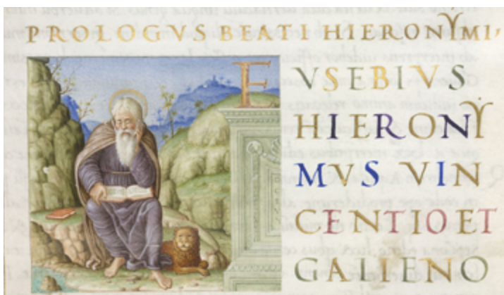
© The British Library (Royal 14 CIII) / Eusebius Chronicle c.1488

The lecture is limited to 500 participants. One log-on device per participant.