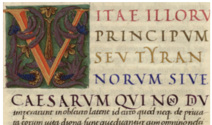
© Biblioteca Nazionale Centrale Vittorio Emanuele II (Vitt. Em. 1004) Historia Augusta c.1478