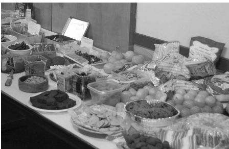
Dorothy's daughter catered a wonderful and healthy lunch, but the snack table helped soothe those peckish in-between moments. All day.

Put January 11, 2014 on your calendar; that's when Trivial Pursuits will whirl into town. You will receive the flyer in the fall mailing with full details. The do-not-mail-before date for your highly decorated envelope is December 9, 2013.