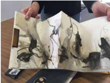
Two examples of our finished work