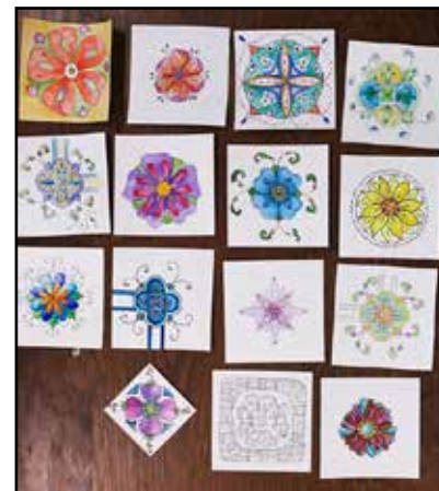
Participants' patterns created with color.