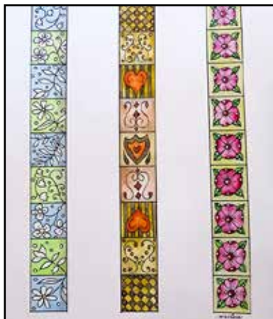
Kathy's example of patterns using color.