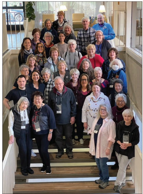
Friends of Calligraphy members who attended Letters California Style 2024 at the Kellogg Conference Center adjacent to the Cal Poly Pomona Campus, Pomona.