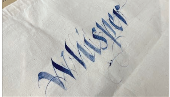
Ed Fong's practice on fabric using a flat brush and EZ-A pen.