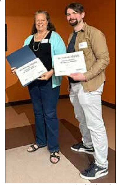
Friends of Calligraphy

Your dedication, planning and organization are truly appreciated.