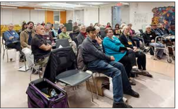
Friends of Calligraphy